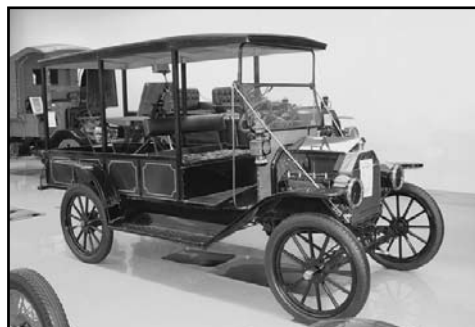
19 Dental Truck?????