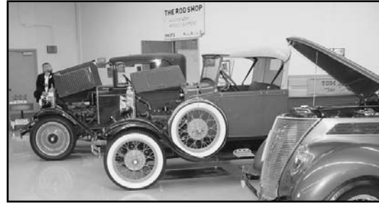
1928 Chevrolet Landau Coupe, 1928 Ford Model A Roadster Pickup, and 1937 Ford Convertible