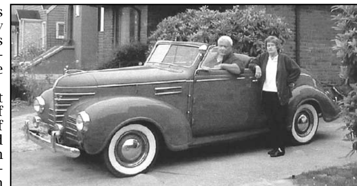
Chuck and Sue Hamaker's 1939 Plymouth Convertible

Chuck and Sue decided they should go look at it. So in May of 2002 they