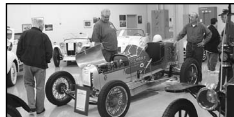
1907 Ford Race Car