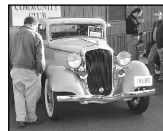
Dan Eatons'33 Plymouth