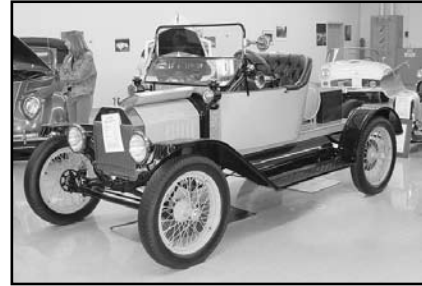
1915 Ford Model T Speedster