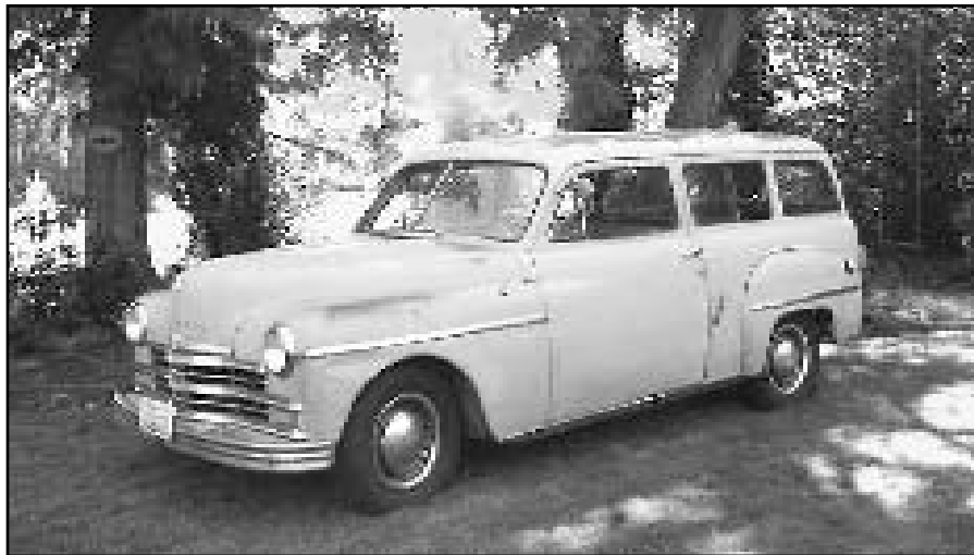
Vicki and Dave Williams latest edition is a 1949 Plymouth Suburban

a little over an hour and loading a pickup load of old spare parts, they were on their way out into the LA traffic.