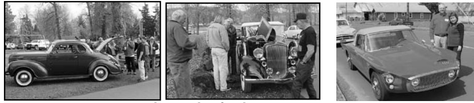
CPPC Members gather for the upcoming Garage Tour