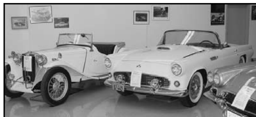
1948 MC Model TC and 1955 Ford Thunderbird