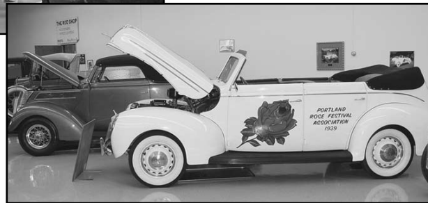
1939 Ford Convertible