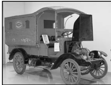
1913 Ford Model T-Depot Hack