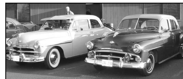
Scott Farnsworth's '50 Plymouth and Jimmy Fox's '52 Plymouth