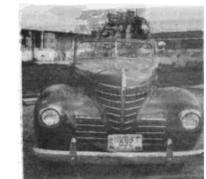
We hope to send you another photo in our '39 Plymouth convertible on our 60th Anniversary!