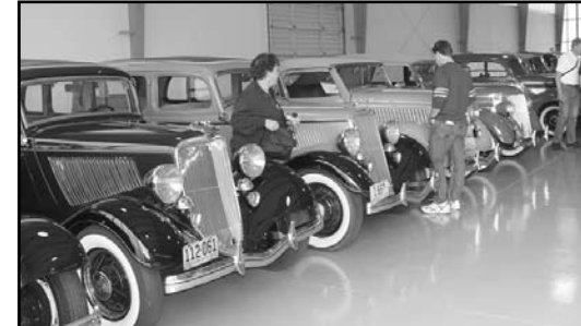
Lorraine Griffey takes a look at amazing collection of Fords Jack Hogan's Collection includes Fords, from 1932 thru 1942 in both Standard & Deluxe models