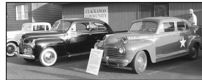
Bob Dimicks'41 Plymouth (I think) and Bill Call's '42 Plymouth Army Staff Car